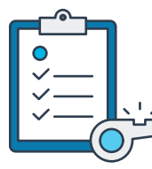
Dedicated Business Coach