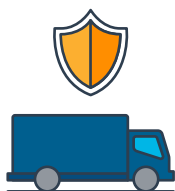
Vehicle maintenance and insurance