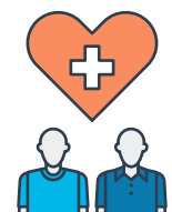
Health benefits and employee services