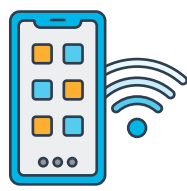
Industrial-grade handheld devices