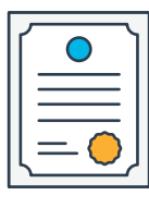
DOT compliance services