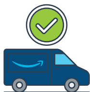
Amazon branded vans customized for delivery

Leveraging Amazon's deals makes the entire setup process easy. We've negotiated exclusive deals on startup assets and ongoing business management services with top-in-class third-party providers to help you get your business started for as little as $10,000.