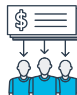
Payroll, tax, and accounting services