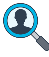
Recruitment tool discounts